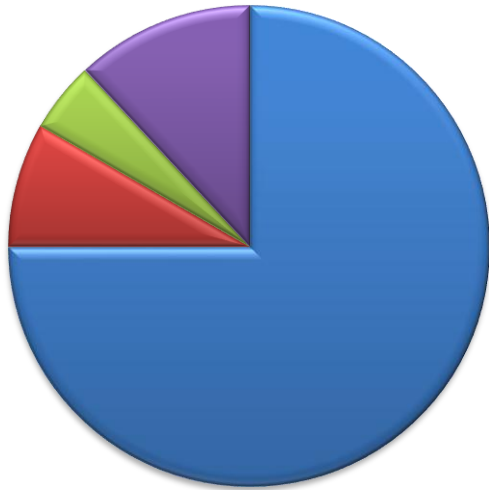
Figure : Digital Medicine Market by Sponsors of Clinical Trial; 2015