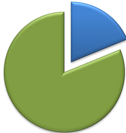
The US Toll Market by Electronic Toll System Account Penetration; 2020